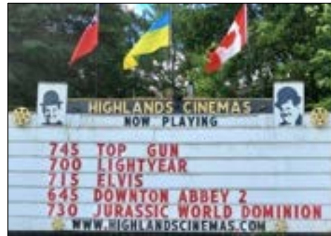
The Internationally Famous Highlands Cinemas