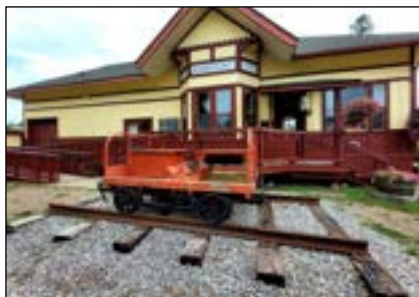
Kinmount Railway Station