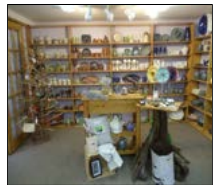
Kinmount Artisans Marketplace