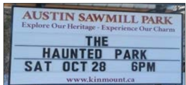
Historic Austin Sawmill Park