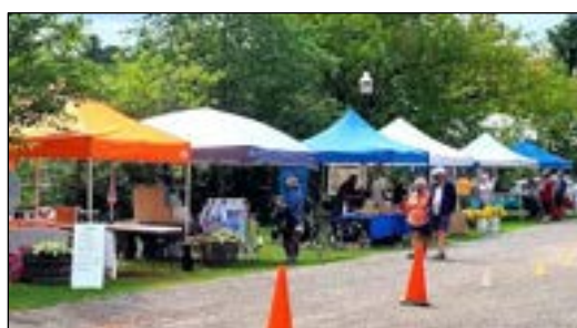
Kinmount Farmers' Market