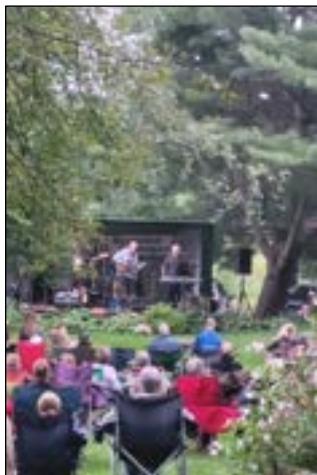
Music in the Park